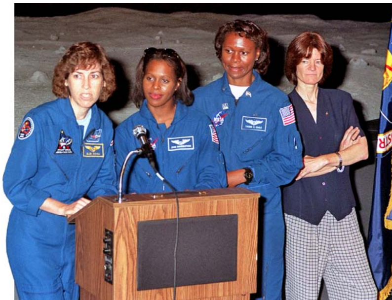
At a conference about women in space