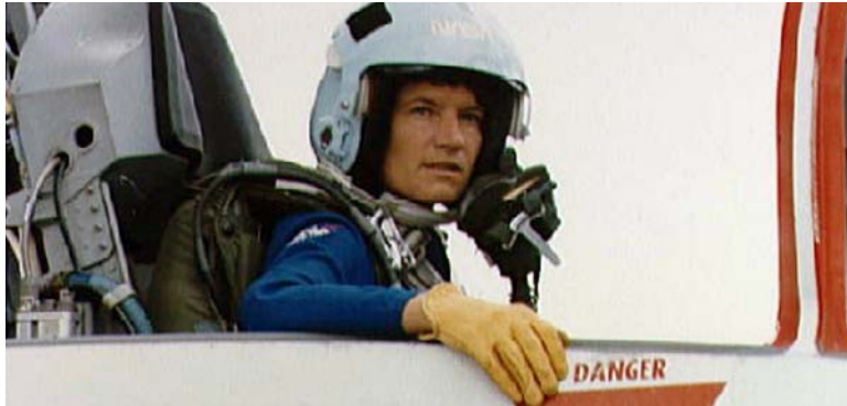
Piloting a plane

Learning to become an astronaut was hard work. Sally had to learn to pilot a plane. She had to learn how to control the launch and reentry of the shuttle. She needed to know how to operate the computer systems and switches on the shuttle. As flight engineer, she had to learn to use the shuttle's robot arm to pick up satellites from space.