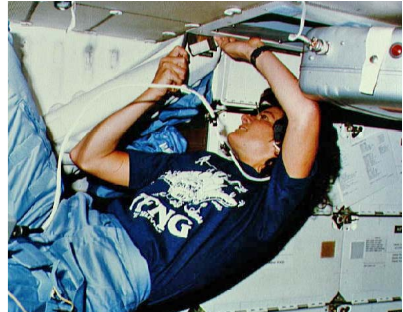
On the shuttle

Sally often worked with one of her astronaut classmates, Dr. Steven Hawley. The two of them fell in love and were married on July 24, 1982. They shared the same excitement about space travel.