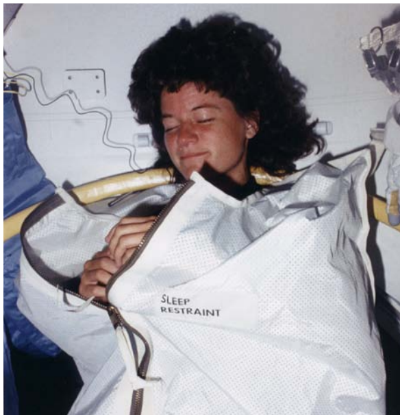
Using a sleep restraint to keep from floating around while sleeping

Sally wrote a book about her space travels. She wrote that the best part of being in space was being weightless. She told how the crew moved around by grabbing onto something on the wall to keep from floating away. When they were working on a machine, they were always strapped in. Most of the time they ate with spoons. They ate sticky food so that it wouldn't float away. They used straws to drink. They stored all their trash and brought it back to Earth.