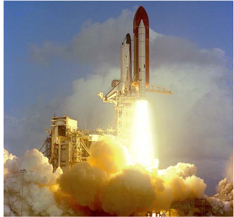
Launch of the STS-7, Sally's first mission in space