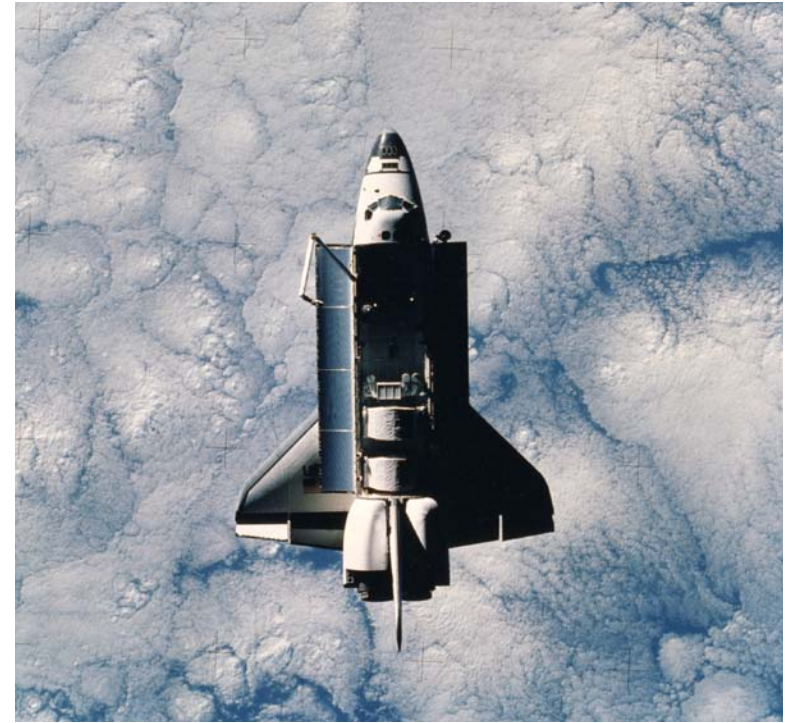
A photo of the Earth-orbiting space shuttle Challenger , taken on the STS-7 mission

Sally was the flight engineer on board. During the time in space she and John Fabian, another scientist, worked on forty experiments. They also tested a 15-meter (50-ft) robot arm. It was used to pick up broken satellites in space. The whole crew returned to Earth in six days. They had traveled 4 million kilometers (2.5 million mi)!