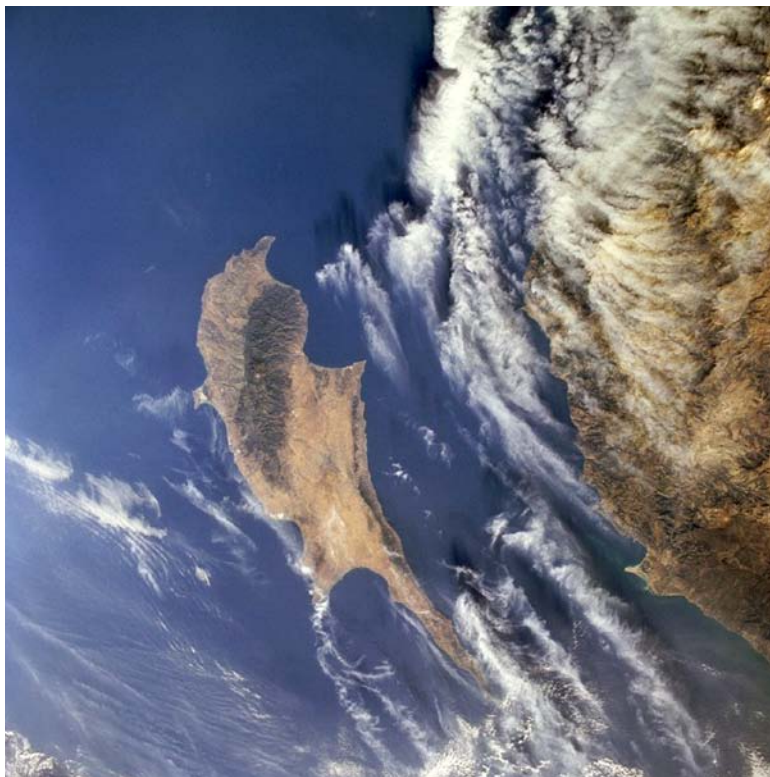
Cyprus and Turkey as seen from the orbiting space shuttle Challenger .

The astronauts took exciting pictures as they circled the Earth. These pictures help all of us see the wonders that the astronauts saw. Sally wrote, "Through the small windows of the space shuttle, I looked down on Earth and saw the oceans and land that make up our planet. The view was spectacular."