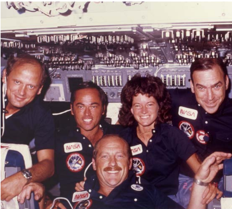
Sally Ride and her crewmates on the STS-7 mission

Sally and four other astronauts were strapped inside the space shuttle. The shuttle was attached to a huge fuel tank. Two smaller rocket boosters were mounted onto the fuel tank. They helped power the shuttle into space. The tank and boosters dropped into the ocean after they used up their fuel. In 44 minutes and 27 seconds, the Challenger was circling the Earth.