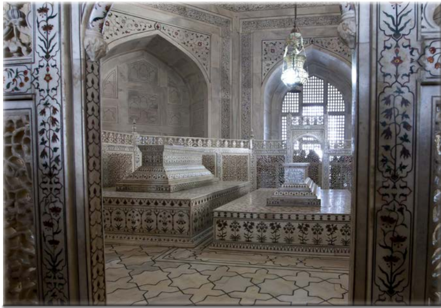
Thousands of visitors come every day to see the empty coffins of Shah Jahan and Mumtaz Mahal.

Visitors can go inside the main building, where Shah Jahan and his wife are buried. A coffin for Mumtaz Mahal is in the center of the room. Her husband's coffin is beside hers.