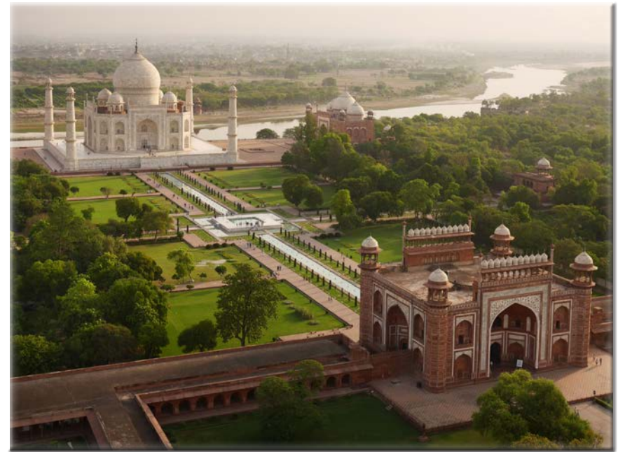
Shah Jahan built the Taj Mahal near a bend in the Yamuna River. The waters there are peaceful.