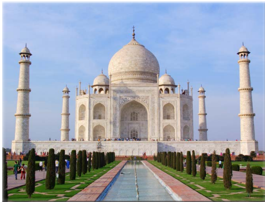
It took almost twenty-two years to build the Taj Mahal.

Huge pieces of white marble were pulled on carts by oxen. Workers used ropes to move the marble into place. The work was finished in 1653.