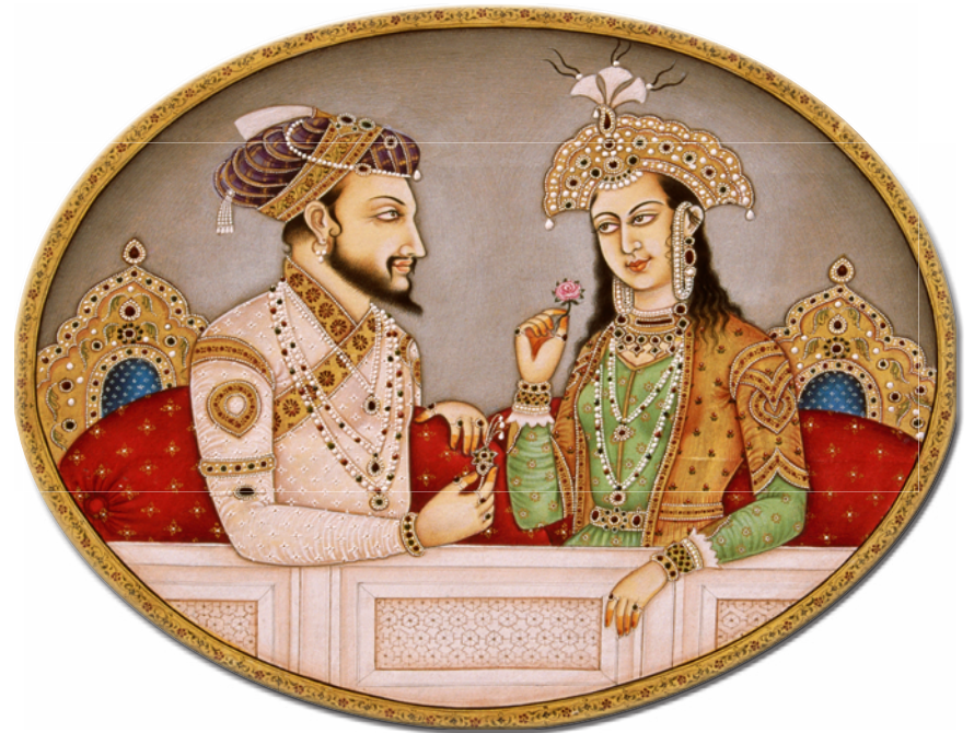
Shah Jahan and Mumtaz Mahal were married for nineteen years (1612–1631).

Both coffins are empty. They are only for people to view. The real burial places are in a room under the main floor.