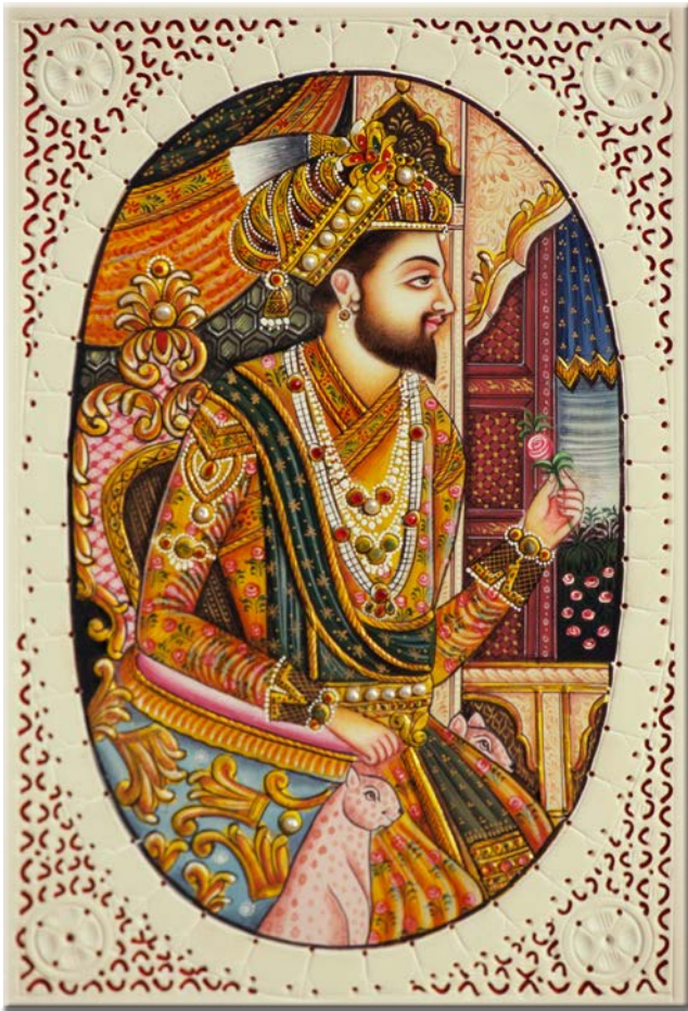
After Mumtaz Mahal died, Shah Jahan lived for thirty-five more years. He died in 1666.

When Mumtaz died, Shah Jahan was heartbroken. People said he was so sad that his beard turned white, and he cried so much, he needed glasses.