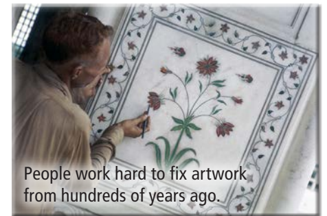
People work hard to fix artwork from hundreds of years ago.

Groups of people work to fix harm caused by air pollution.