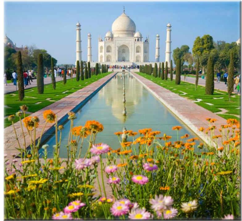
To many people, the Taj Mahal is one of the most beautiful places on Earth.